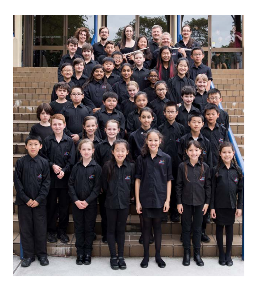
Symphonia Jubilate Secondo (Conductors and mentors in back row)