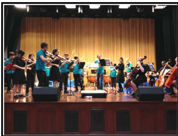
An item being performed at the Shanghai No 3 Ladies High School.