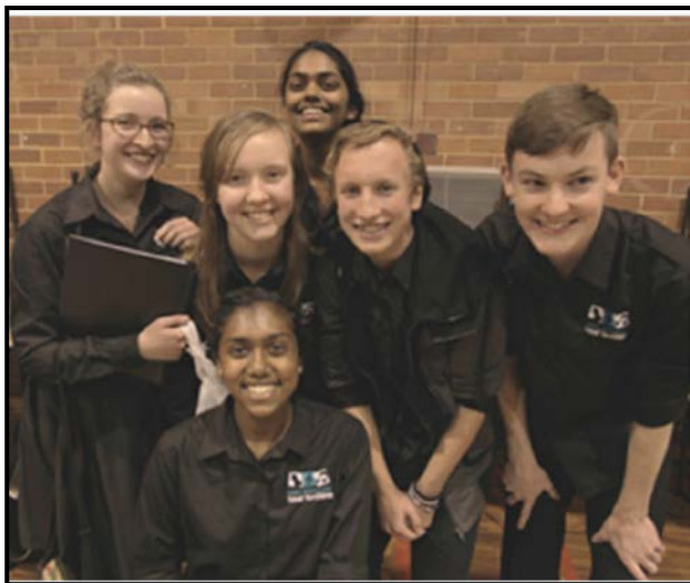
Some SJ Primo performers in their "China Tour" performance uniforms.