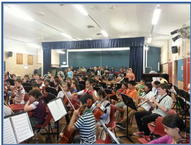
Symphonia Jubilate rehearsing in Concord West Public School hall.

The orchestra was formed in late February 2013 as a Strathfield community of schools initiative. At the first rehearsal, there were sixty enrolments. At the second rehearsal in early April, there were over eighty enrolments. At the third rehearsal in May there were almost one hundred enrolments and community support and recognition for the orchestra.