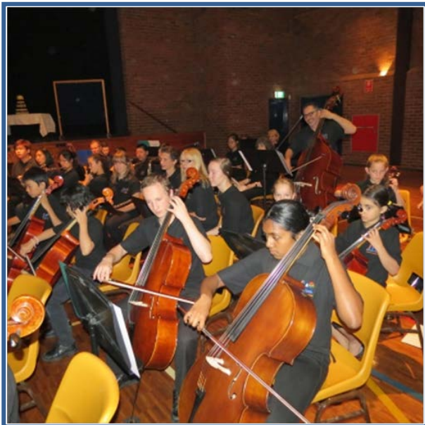
SJ in the Marie Bashir PS hall, performing at the naming ceremony.

Professor Marie Bashir commended the orchestra and took the time to speak to many of the Symphonia Jubilate students.