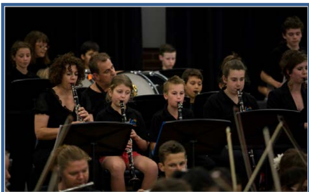
The woodwind section at the High Tea concert.

This concert event was an affirmation of the success of the orchestra. It was also an opportunity to thank the committee and community members who had supported it throughout 2013.